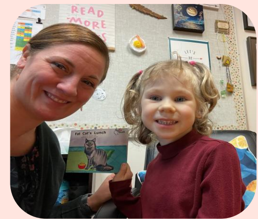
Reading and reaching goals!