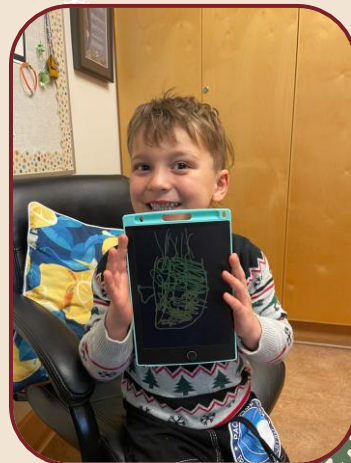
A steaming cup of coffee!