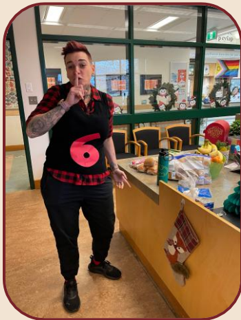
Last week we held a secret spirit day celebrating the numbers 6 & 7 because it was the 67th day of Kindergarten!